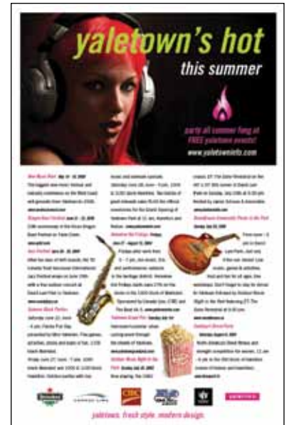
2008 "Yaletown's Hot" events poster

"Loved it! This is the kind of thing Vancouver should be promoting and hosting. We are a world-class city and need to have events like this that are commonplace among other comparable worldly cities! Great job and keep it up!" B. Elliot, Outdoor Movie Night in