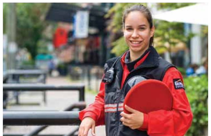
Yaletown's Ambassadors carried out 5,000 hours of security patrols during the year