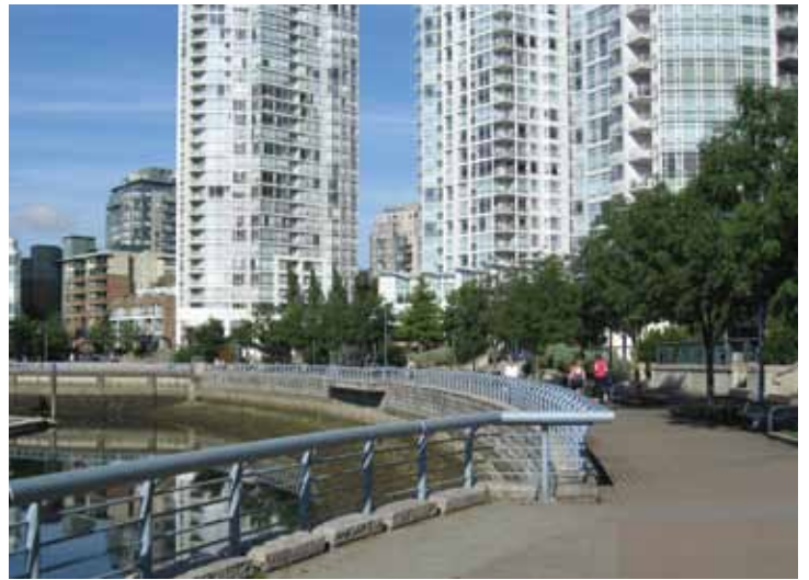
million-dollar condos along False Creek at the foot of Davie Street

Not only does this make Yaletown one of Vancouver's most spectacular places to shop and dine, but Yaletown was reported by Good Morning America in 2006 as one the five best places in the world to live because of its close proximity to the ocean and a downtown urban lifestyle. In fact, Yaletown is one of the most studied and imitated neighbourhoods in North America with a unique heritage and a live-work ideal that is second to none.