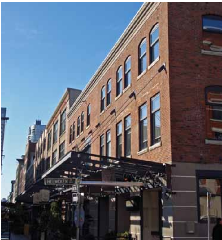
heritage architecture blends easily with the new

world class cities such as Dubai have tried to recreate Yaletown's unique style with features such as a seawall walk