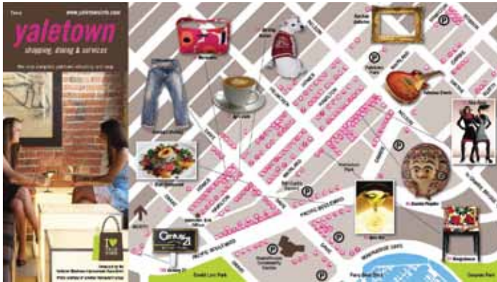
Yaletown Map – the only complete shopping, dining and services guide

the YBIA's successful events have attracted an estimated 300,000 shoppers and diners to the area annually