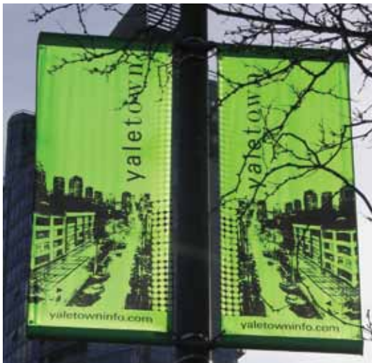
bright green street pole banners now identify and unify the entire YBIA area