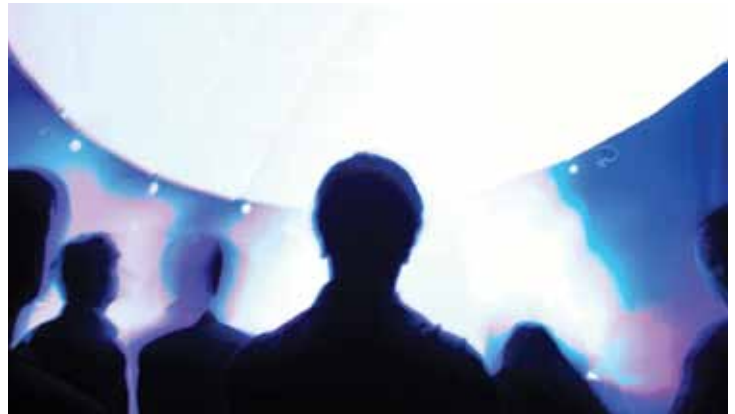
live music, evening illuminations and outdoor celebrations during the 2010 Olympics

the YBIA will continue to lobby the City to create special liquor licences that extend operating hours during the Olympic Games