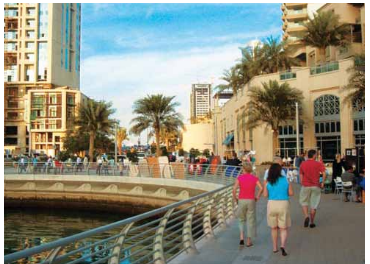
seawall walk along the Dubai waterway